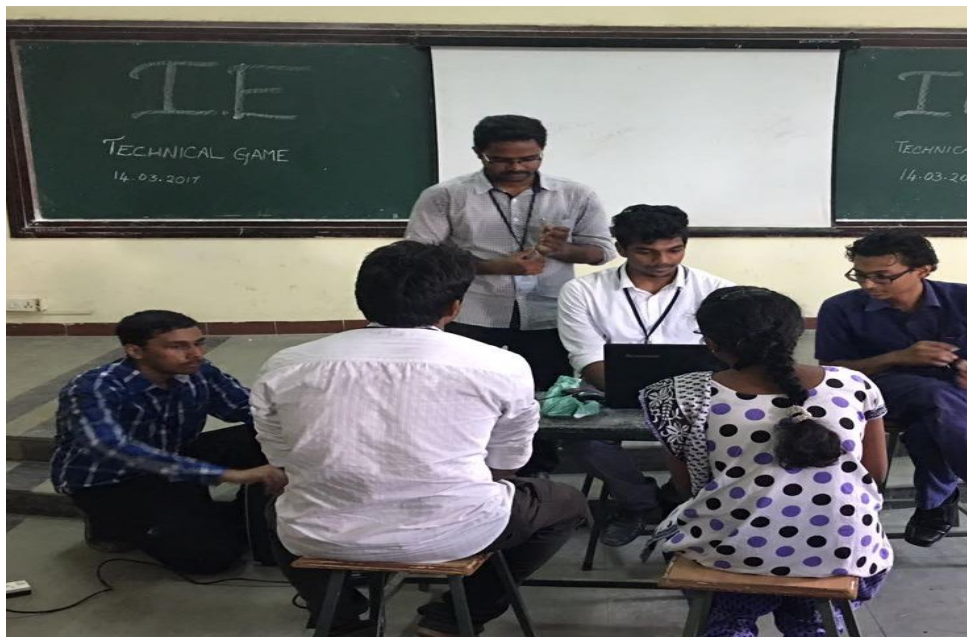
Students participating in guess a word Event

All the students took part in this event with great enthusiasm and found the event to be very useful. Thus, the event turned out to be a great success and the students are looking forward for more events like this in the upcoming years.